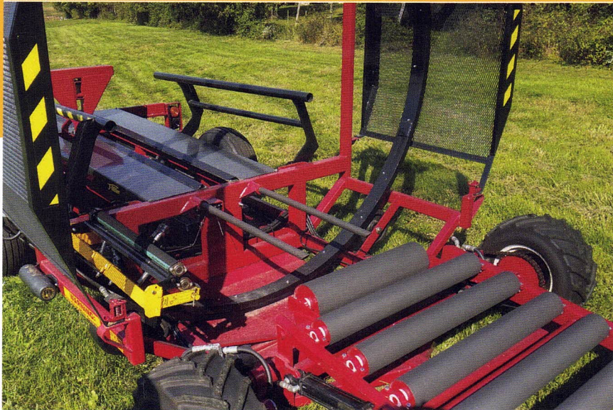
Model 4511 Wrap watch standard